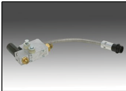
Automatic Electric Gun