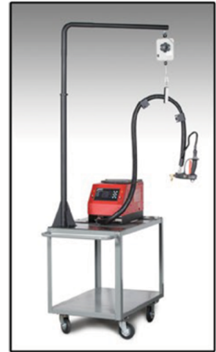
Cart mounted with Hose Boom